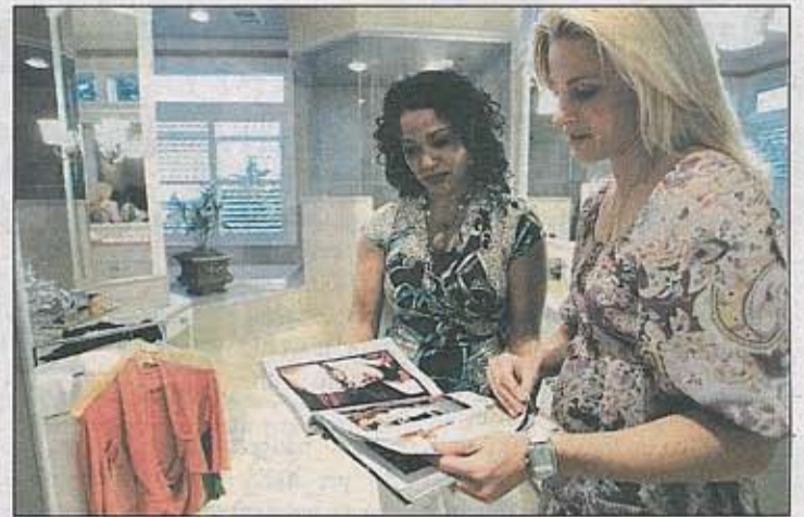
A fashion magazine is checked for styles.

Carrie Wood can be reached at carrie.wood@reporternewspapers.com or 425-453-4290.